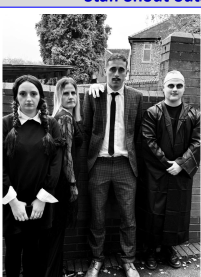
The Year 5 Adams Family