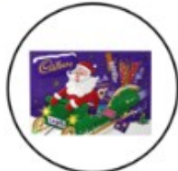
Chocolate Selection Box