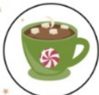
Instant Hot Chocolate